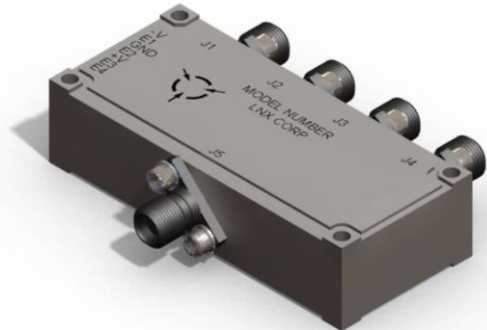
Table 1 SP4T Specifications